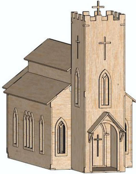
The Medieval Church